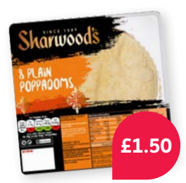
RRP £2.60 72g