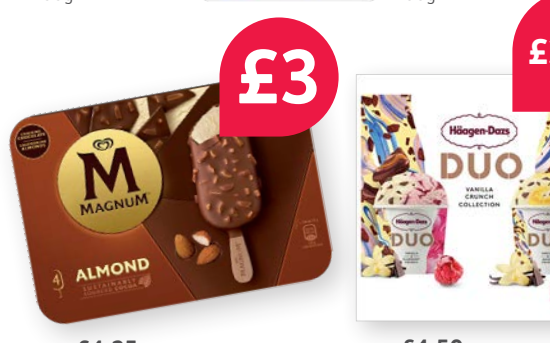
RRP £4.25 400ml RRP £4.50 380ml